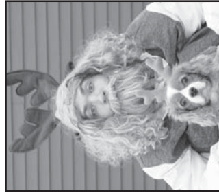
★ “Sonnet Sonata”