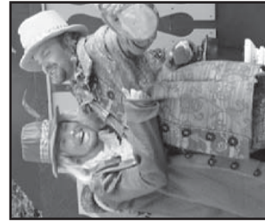
★ “Twelfth Night”