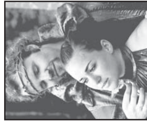
★ “A Midsummer Night’s Dream”