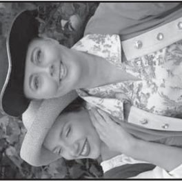
★ “The Merry Wives of Windsor”